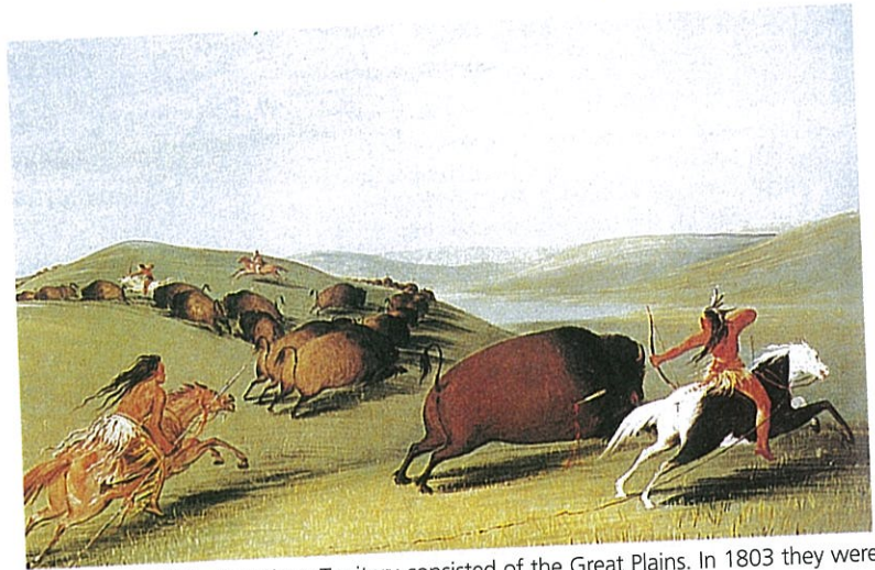
A Much of the Louisiana Territory consisted of the Great Plains. In 1803 they were inhabited by Native Americans such as these hunters painted by George Catlin.